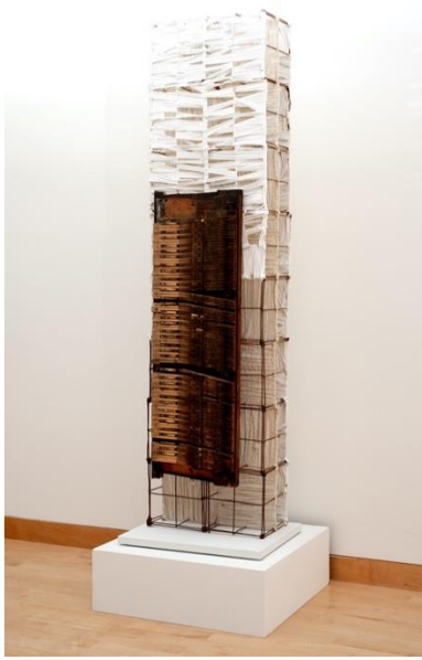
Jin Soo Kim, Strata , 1991. Chenille bedspread, acrylic steel, copper wire, medical plaster bandage, and found keyboard. 100 x 26 1/2 x 13 in. Purchase, through Rudolph and Louise Langer Fund