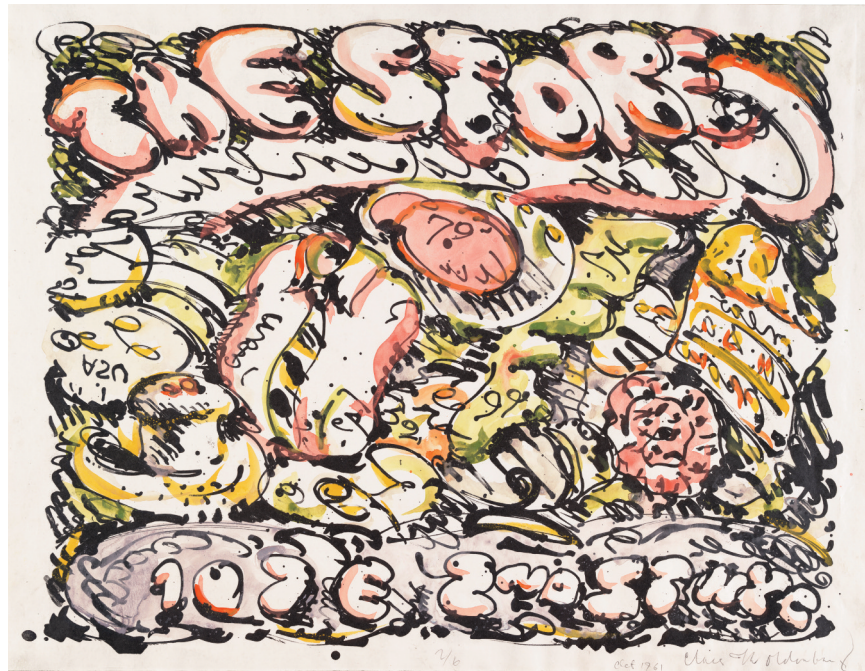
Claes Oldenburg Store Poster , 1961 Lithograph with watercolor additions 20 x 25 15/16 inches Publisher: Claes Oldenburg, New York. Printer: the artists at Pratt Graphics Center, New York. Edition: 6. The Associates Fund, The Museum of Modern Art, New York © 2011 Claes Oldenburg

including the works on paper shown at the Judson Gallery in 1959 and 1960, show a roughness of imagery and a nervous line that alludes to street writing and graffiti. For his first major installation, The Store (1961), he displayed and sold sculptures of dry goods and foods made of chicken wire and muslin constructions covered with plaster and painted with loosely brushed applications of enamel. As a part of his self-promotion he created a letterpress poster and a lithographic Store Poster , several impressions of which he hand colored with watercolors. In this small-editioned fine art “poster,” with its rambling and ballooned comic strip letters, the Imagists could find sympathetic company. Oldenburg, as well as Hockney, denied early on that he was a Pop artist. In