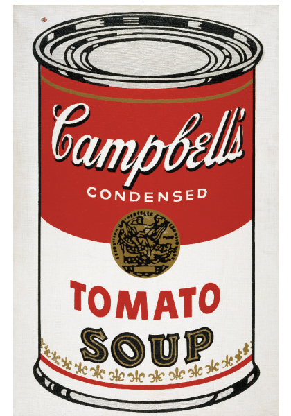
Andy Warhol Campbell's Soup Can, 1964 Oil on canvas 36 x 24 inches Gift of Robert H. Halff through the Modern and Contemporary Art Council, Los Angeles County Museum of Art © Andy Warhol Estate/Artists Rights Society (ARS), New York