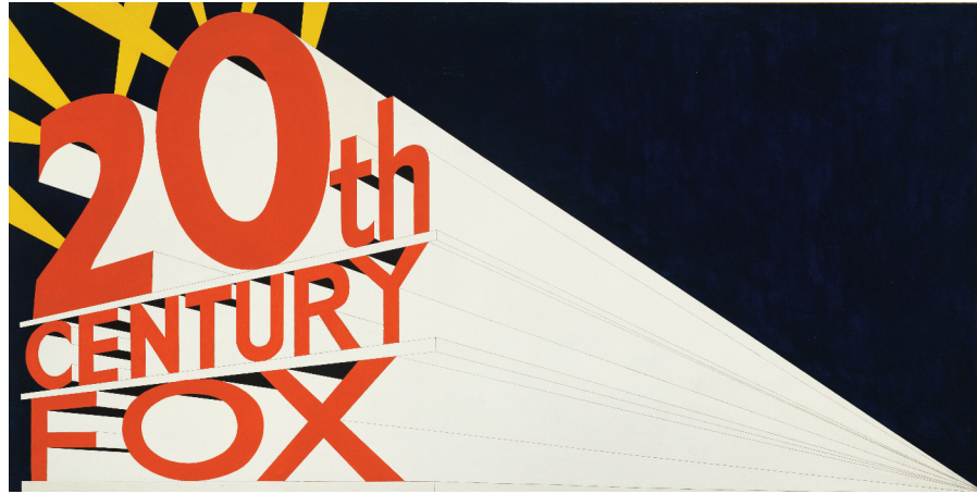
Edward Ruscha Large Trademark with Eight Spotlights, 1962 Oil on canvas 66 ¾ x 133 ¼ inches Purchase, with funds from the Mrs. Percy Uris Purchase Fund, Whitney Museum of American Art, New York

there; in the next decade, Hockney, Kienholz, and Rosenquist were added to the list. It was somewhat hard to know where New York left off and Los Angeles began.