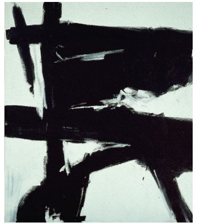
Franz Kline Conrada , 1960 Oil on canvas 91 3/4 x 79 inches Grant J. Pick Purchase Fund, The Art Institute of Chicago © 2008 The Franz Kline Estate / Artists Rights Society (ARS), New York

Because of New York’s clout, Pop art had been anointed by 1963 the gold standard of the new—more so than post-painterly abstraction, which quickly assumed its place in a tradition over a half century old. Like the power base historically known as the East Coast establishment (with its symbiotic intermingling of media, Wall Street finance, Ivy League schools, and legal and business structures), the New York art establishment was also a coterie of aligned interests—art criticism, art magazines, art galleries, auction houses, and museums that since World War II has formed a critical