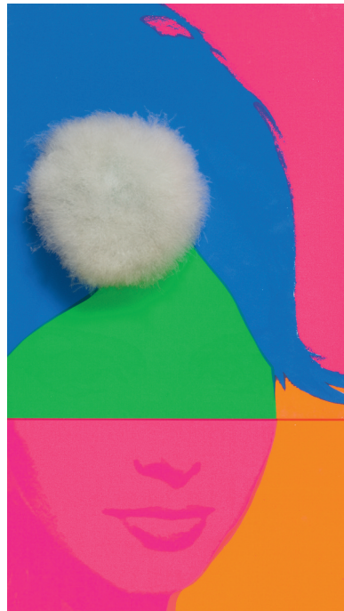
Martial Raysse Untitled from Das Grosse Buch , 1963, published 1964 Screenprint with feather additions, from an illustrated book 16 7/8 x 14 3/8 inches Publisher and printer: HofhausPresse, Dusseldorf Edition: 100 Linda Barth Goldstein Fund, The Museum of Modern Art, New York © ARS, NY

Ferus Gallery and Dwan Gallery were among a new set of art galleries in support of contemporary art that recently had begun to appear in Los Angeles. In addition to the opening in 1965 of the Los Angeles County Museum of Art, reincarnated in a new building and now devoted exclusively to fine art, a new arts infrastructure in Los Angeles could brandish, by the mid-1960s, a respectable roster of art critics—John Coplans, Philip Leider, and Peter Plagens, among others—and host the headquarters of Artforum before it gravitated its operations to New York in 1967. The city's new generation of artists linked to Pop art—and the implicit rejection of lingering Abstract Expressionist styles—included native sons (Billy Al Bengston, Ed Kienholz, Ed Ruscha, Kenneth Price, Mel Ramos, and Wayne Thiebaud, albeit the latter two with roots in Sacramento) and artists in short- and long-term residencies (Claes Oldenburg, 1963–64; David Hockney, 1963–2005). Additionally, artists who were primarily based in New York intermittently came and went, particularly those artists who made printed editions at the newly opened print publishing workshop Gemini G.E.L. By 1970, Lichtenstein, Oldenburg, Price, Rauschenberg, Ruscha, and Thiebaud had made their first editions