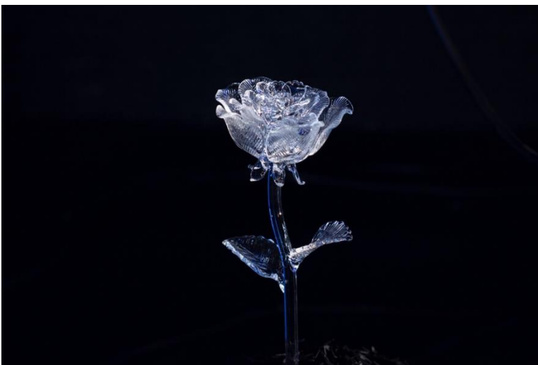
> SHAWNÉ MICHAELAIN HOLLOWAY, shawne+michaelain+holloway+_ +dog+whistle+2019+_+rose+ close+up , 2019, digital image.

closeLISTENER(reverse, react, “desire”) explores how vibrations enter the body, through asking what listens for these almost imperceptible frequencies. The artist uses the analogy of a JavaScript framework called an “event listener,” which is a function of computer code that asks the computer to wait until an action occurs within a program to activate a second set of instructions. What happens during the waiting period is called “listening.”