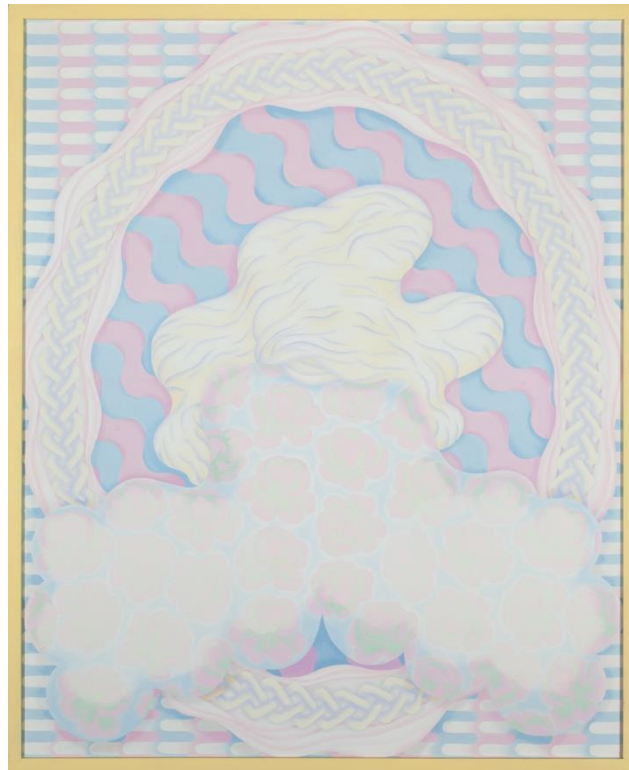
> Sarah Canright, Shadow , 1969. Oil, 33 3/8 x 27 1/4 inches. The Bill McClain Collection of Chicago Imagism, Collection of the Madison Museum of Contemporary Art. © Sarah Canright

Framed by feminist film theory, Vertical Amnesia engages in a dialogue with select women of the Chicago Imagist movement. In addition to Ramberg, Sarah Canright, Suellen Rocca, and Barbara Rossi acknowledged the raking gaze directed at the female body and disarmed it with humor and frank assessment. Unlike their male counterparts in the group, these artists were seeing very differently—not as “other” or object, but as reclaimed and reasserted subject. Often read as fetishistic representations, Ramberg described her work as stemming from her own interest in clothing and